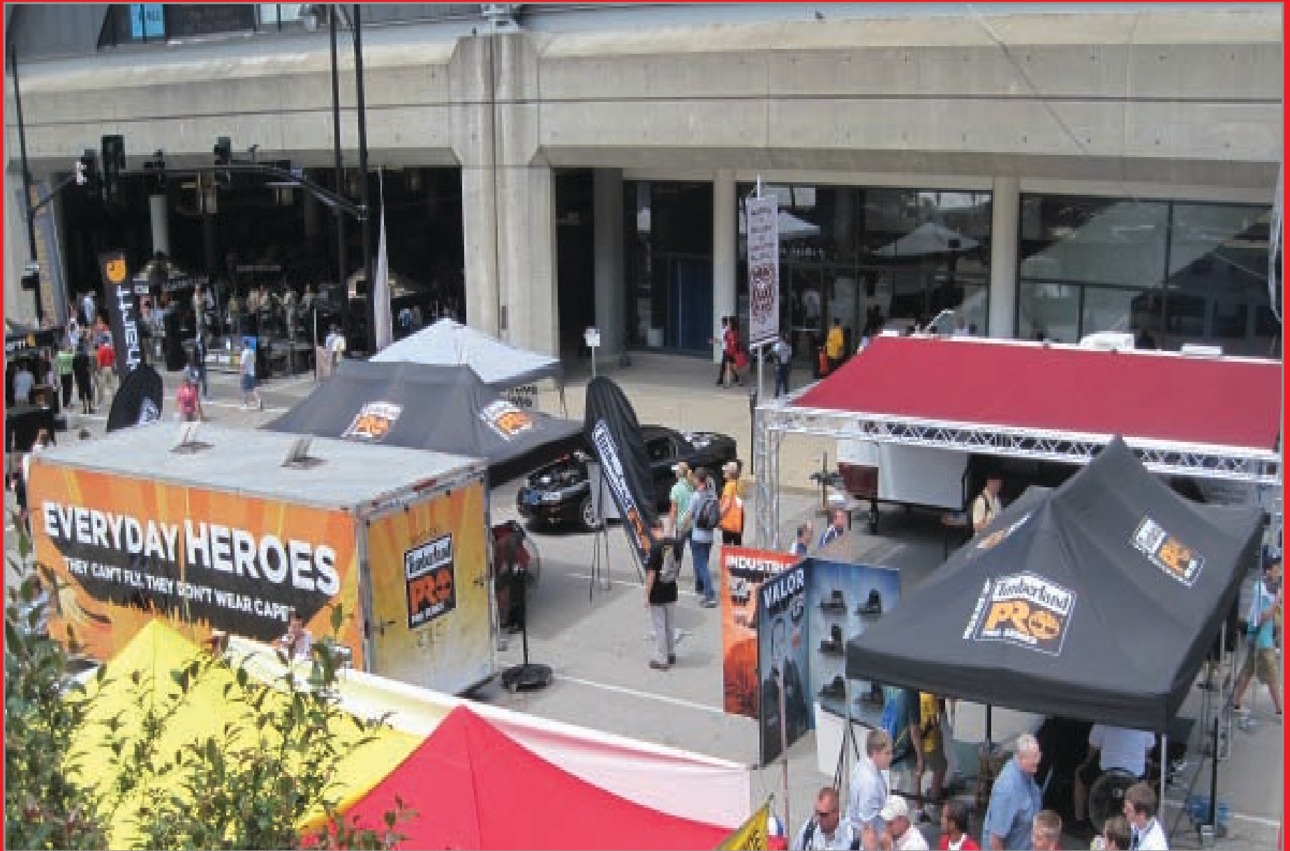
Timberland PRO Sponsorship of the SkillsUSA National Service Day