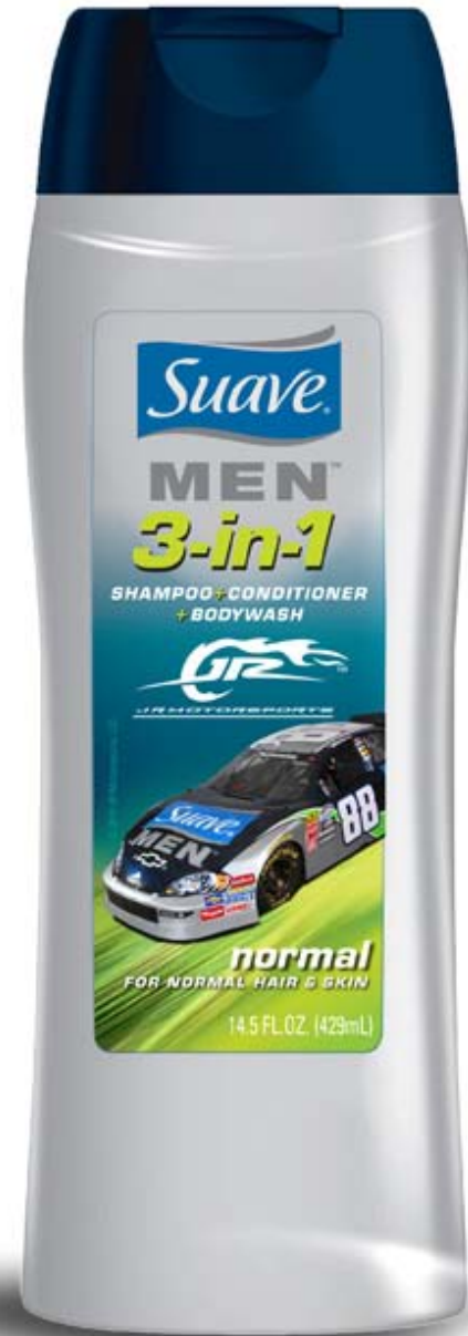
Suave For Men Dale Earnhardt Jr Co-Branding