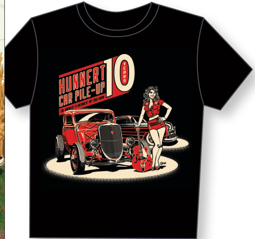
Hunnert Car Pile-Up 10th Anniversary Poster and Event T-shirt