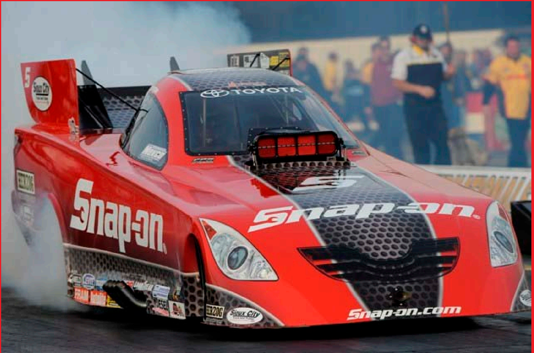
Snap-on Tools/Cruz Pedregon NHRA Full Throttle Sponsorship