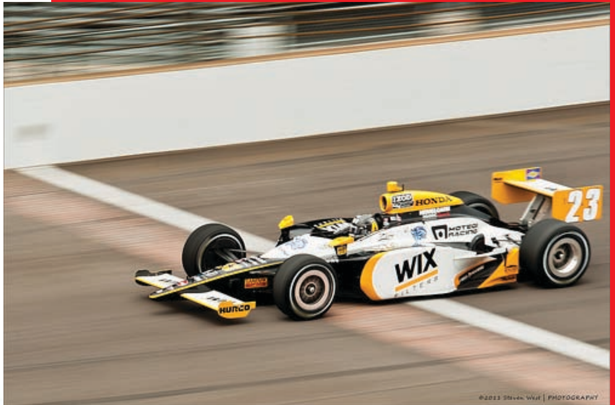
Paul Tracy WIX IndyCar Sponsorship