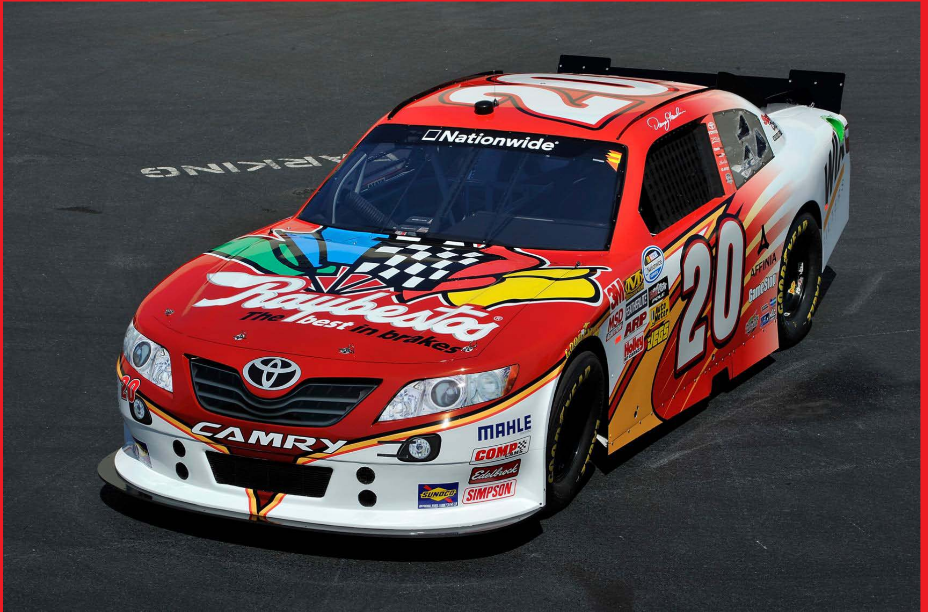
Raybestos/WIX Joe Gibbs NASCAR Sponsor Partnership