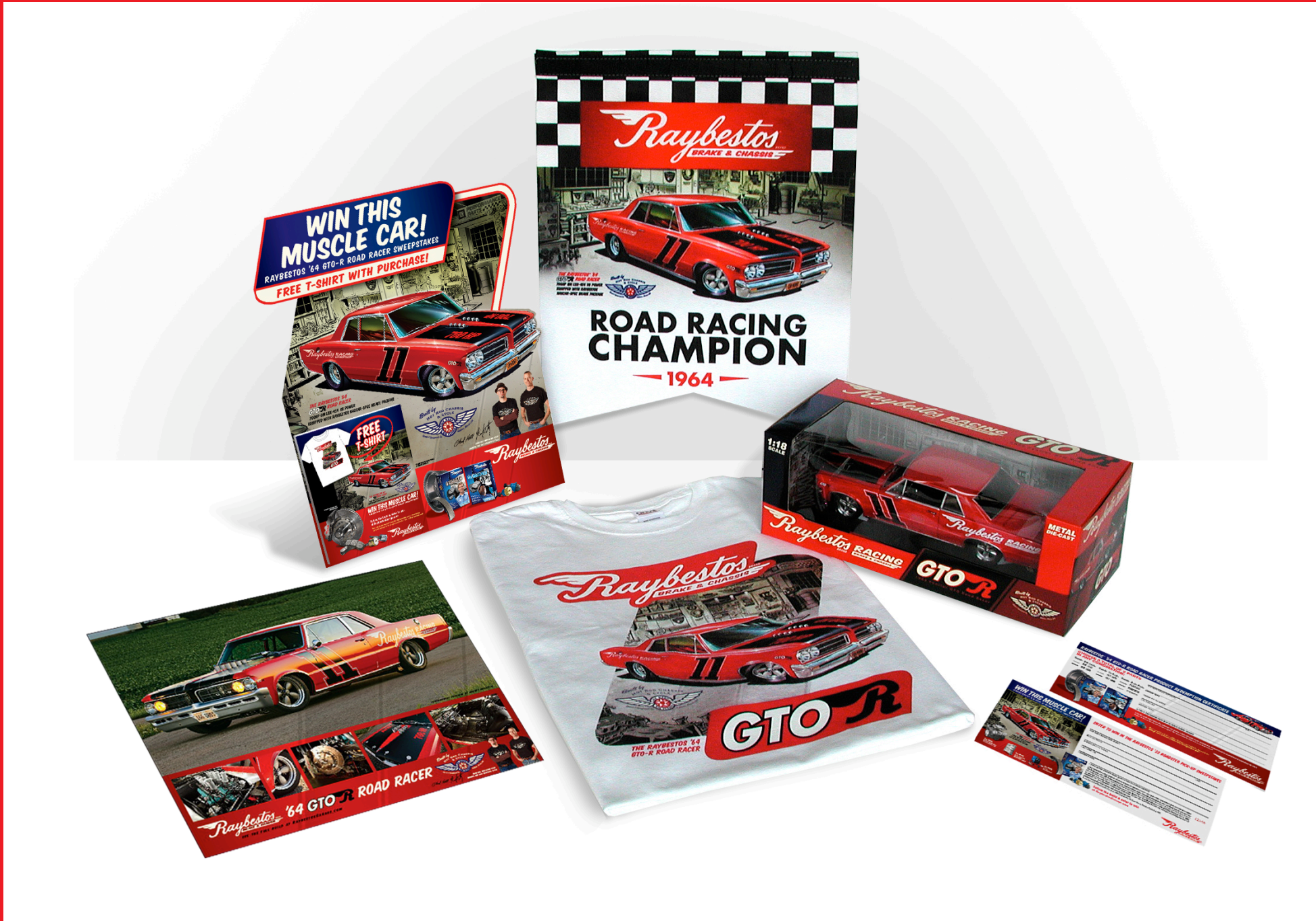
Raybestos 1964 GTO-R Give-A-Way Promotion