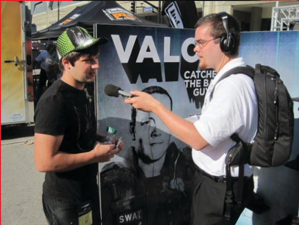
Timberland PRO Sponsorship of the SkillsUSA National Service Day