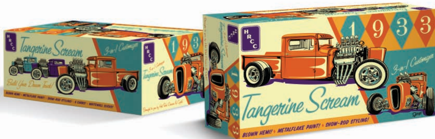
Hot Rod Chassis & Cycle Tangerine Scream Ad and T-shirt Packaging