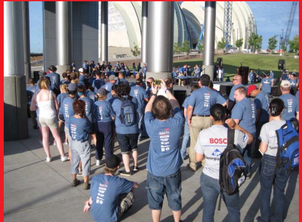
Timberland PRO Sponsorship of the SkillsUSA National Service Day