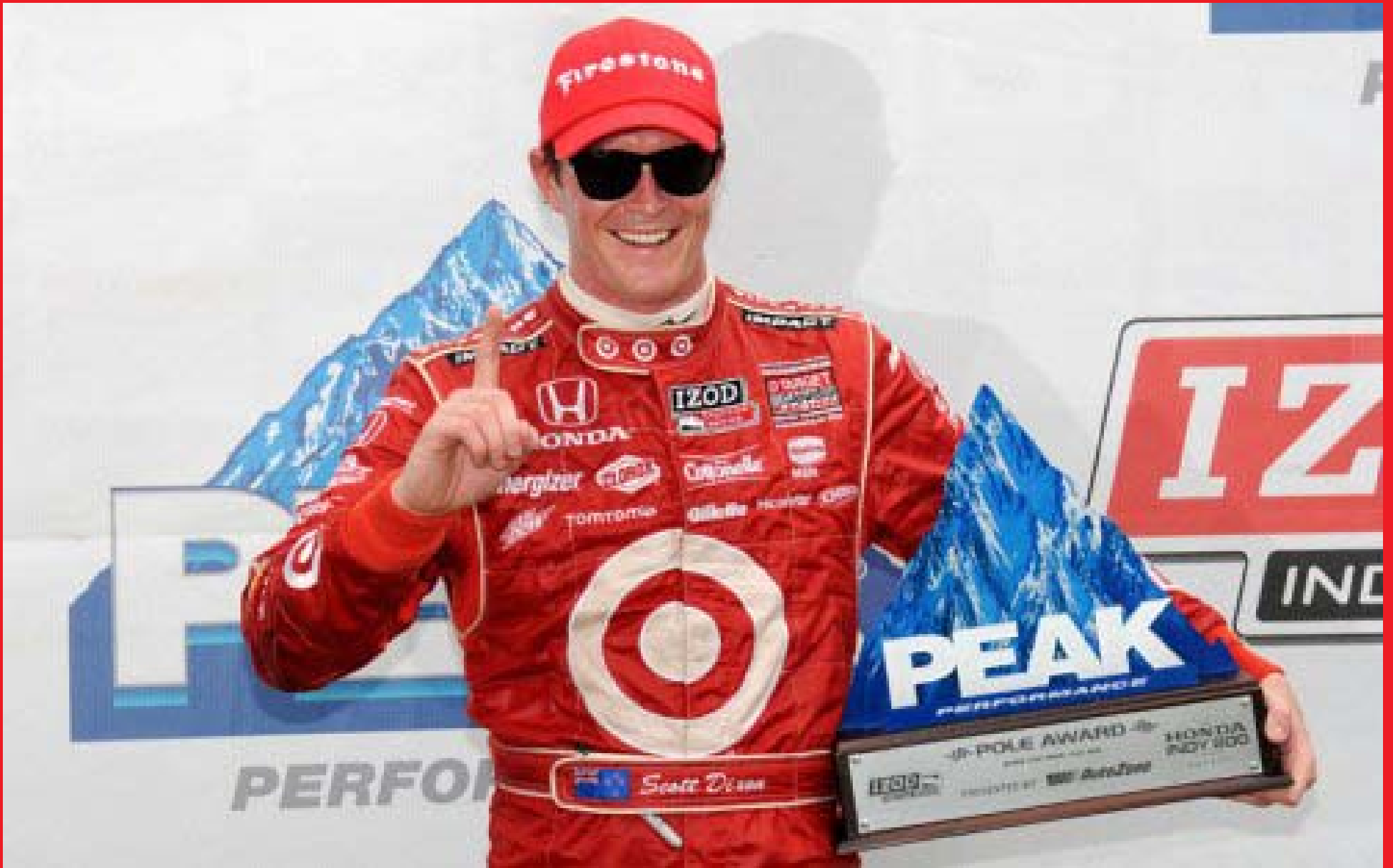
IZOD IndyCar PEAK Performance Pole Award Program