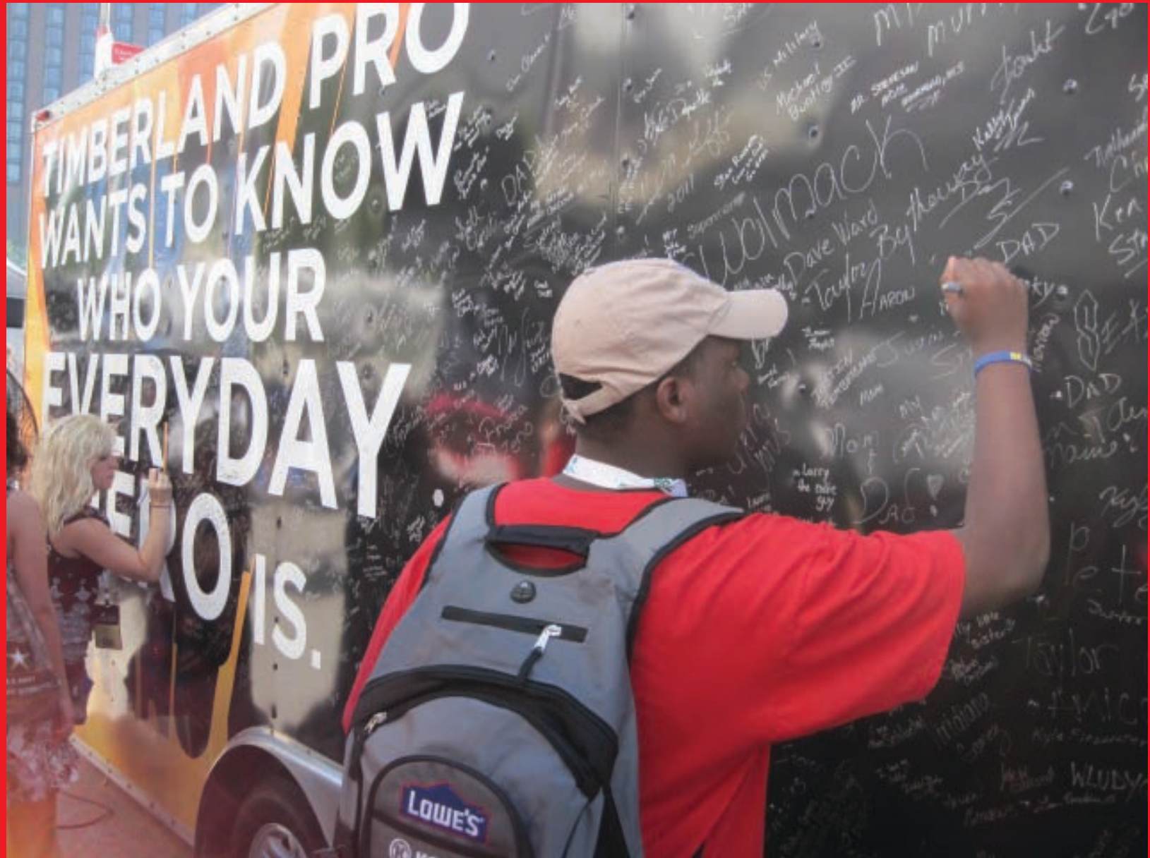
Timberland PRO Sponsorship of the SkillsUSA National Service Day