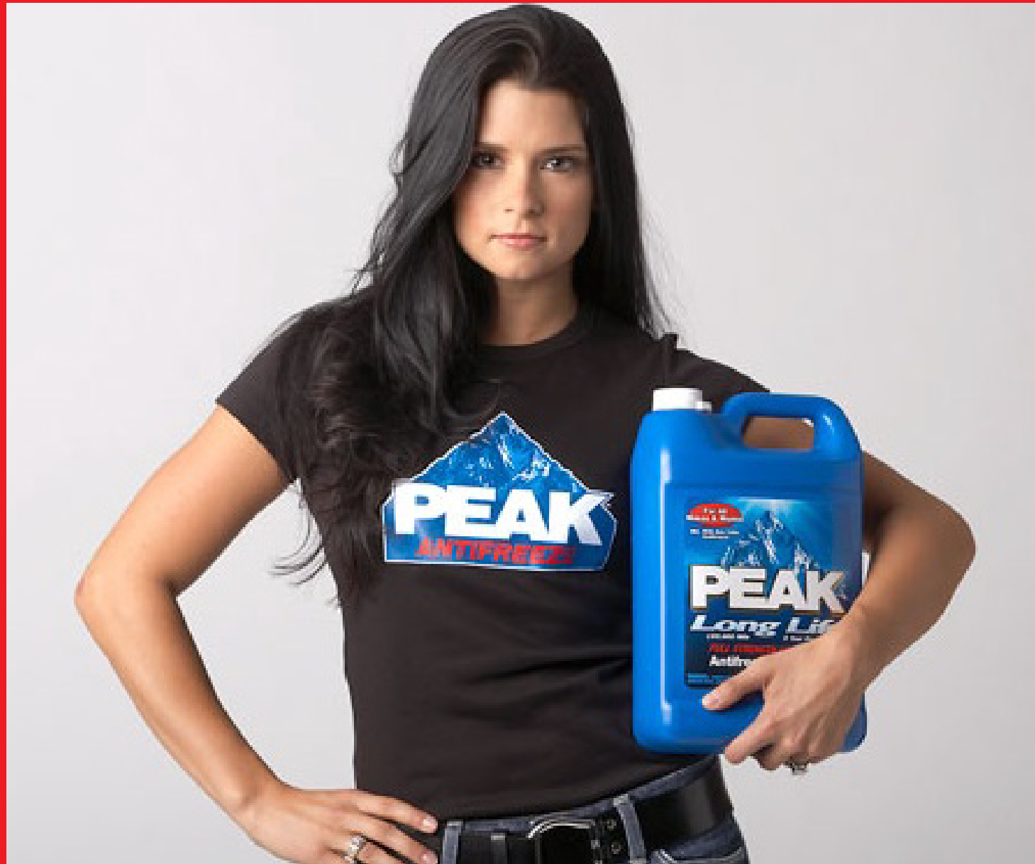
Danica Patrick PEAK IndyCar & NASCAR Sponsorships