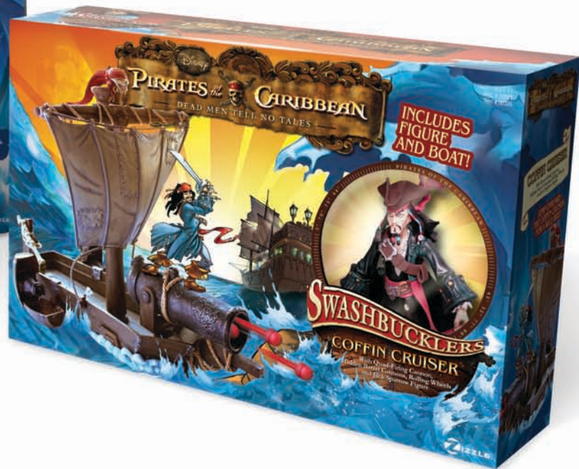
Pirates of the Caribbean Packaging