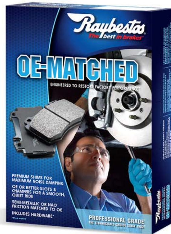
Raybestos Brake Packaging