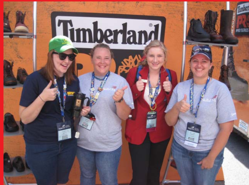
Timberland PRO Sponsorship of the SkillsUSA National Service Day