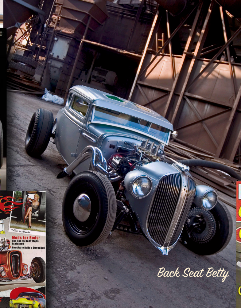
Back Seat Betty